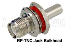
Panel Mount Bulkhead