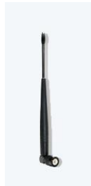
900Mz Antenna 7 inch length Right Angle/Straight