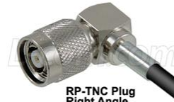
Right Angle Connector