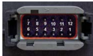
P1 Connector Pin Numbers