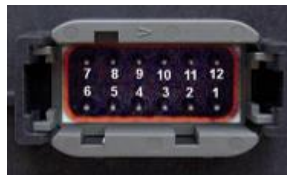
P1 Connector Pin Numbers